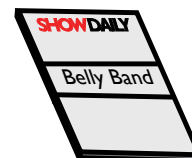
Belly Band ( Four Colour )